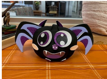
Pumpkin Contest winner!