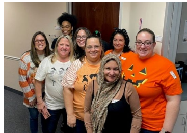
Early Childhood Specialists