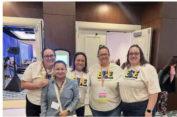
ELC Staff meet up with some Preschool Providers at the FLAEYC Annual Conference in Orlando, FL.

Reigniting the Passion! was the theme of the FLAEYC Annual Conference in Orlando in October. ELC Staff enjoyed keynote sessions, attended workshops, and sharpened their skills. Staff also got to experience new child play spaces, visit with vendors and have a little fun, too.